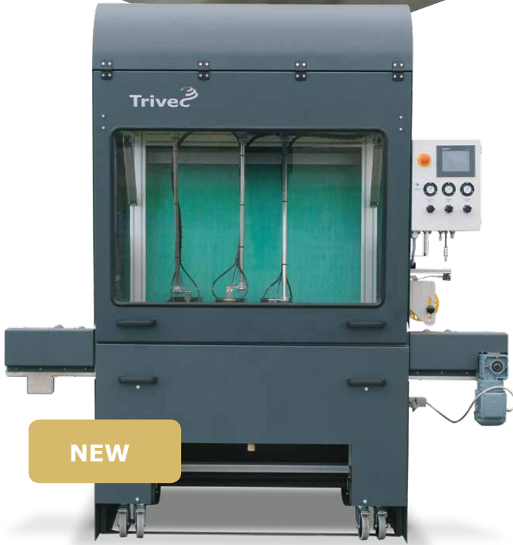
COATING SOLUTIONS Trivec TMC400QS Sprayer Machine