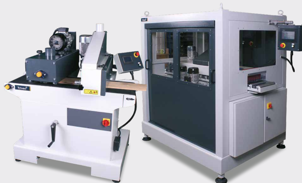
SURFACE SOLUTIONS Trivec DB400CCB1 Cross Cutter