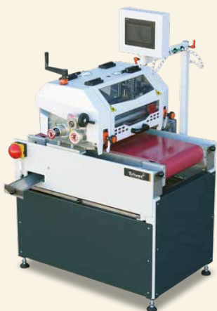
COATING SOLUTIONS Trivec TRV450C Roller Coater