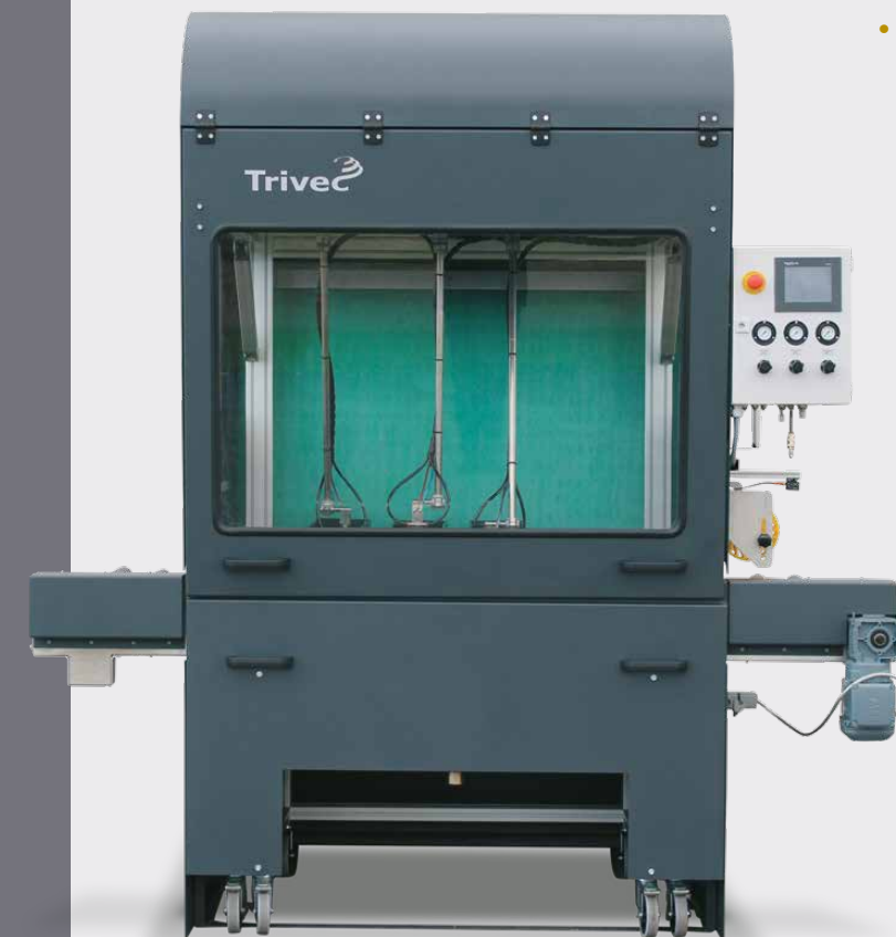
COATING SOLUTIONS Trivec TMC400QS Sprayer Machine